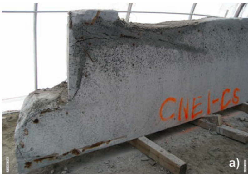
Fig. 3. Longitudinal section of the non-collapsed part of the slab showing the presence of highly deteriorated concrete on the surface of the thick slab, behind the shoulder of the joint

Improper rebar detailing during design – In the structure as designed, the concentration of numerous rebars on the same plane in the upper part of the abutment created a plane of weakness where horizontal cracking could occur. Top bars No. 14 were not anchored at the end. Detailing by today's standards would require that the No. 8 U-shaped hanger bars be hooked around No. 14 bars.