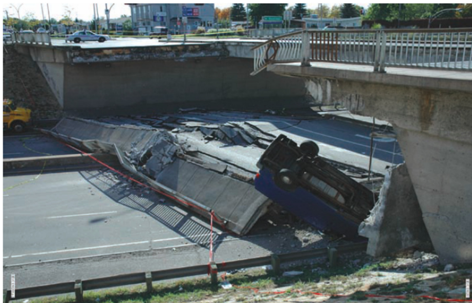
Fig. 1. View looking to the west of the collapsed de la Concorde overpass, from the east abutment, on September 30, 2006

a single-span deck, without intermediate supports. The box girders were installed side by side to form the bridge deck and were supported at both ends by cantilever beams extending from the abutments. The slender superstructure reduced significantly the excavation depth required for the open-cut construction of the freeway underneath.